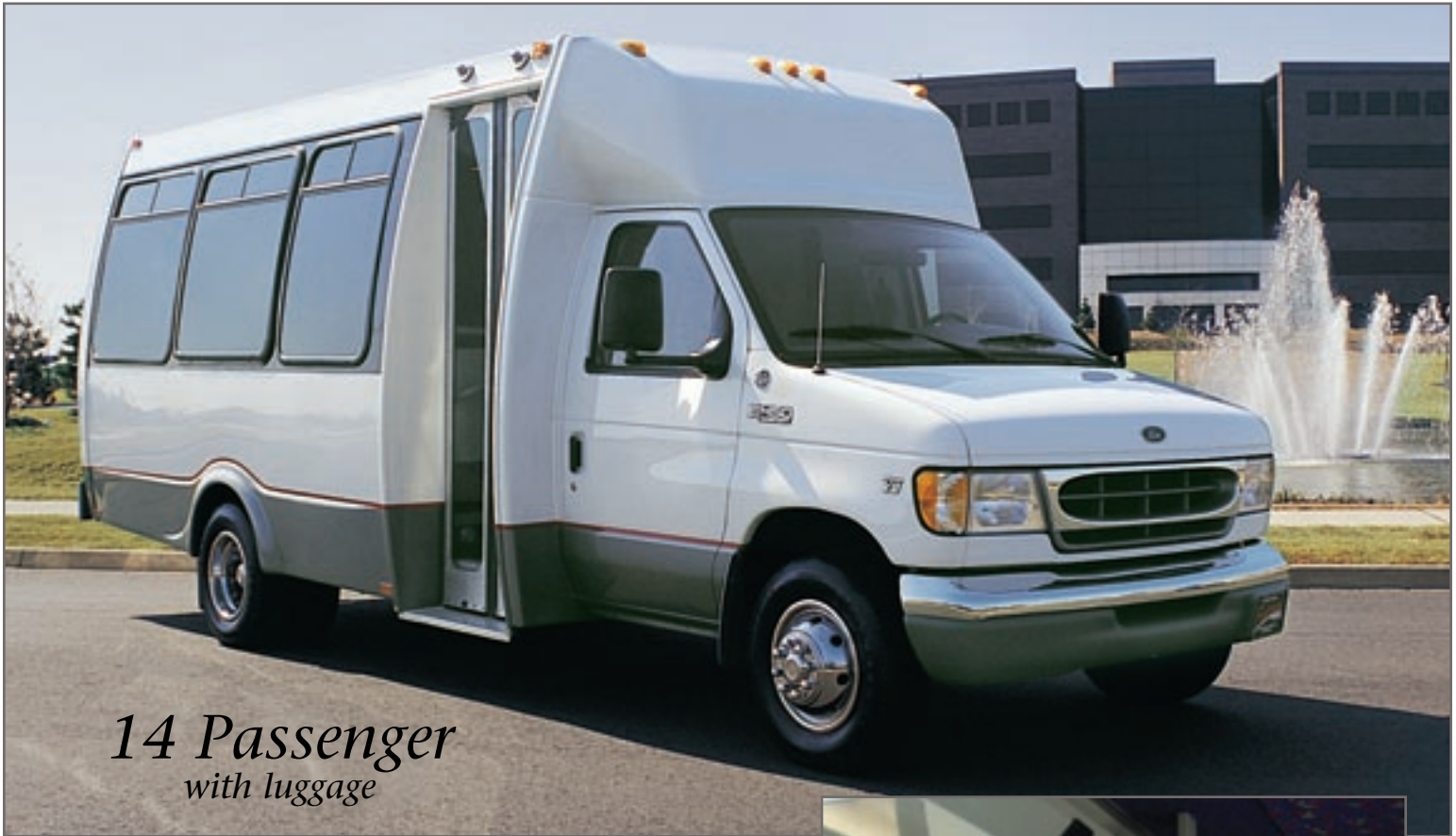
14 Passenger with luggage