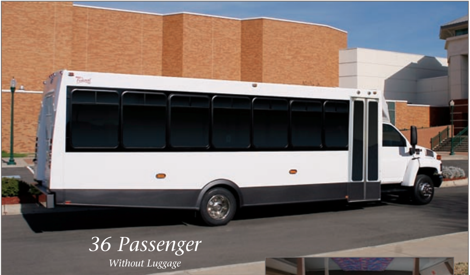
36 Passenger Without Luggage